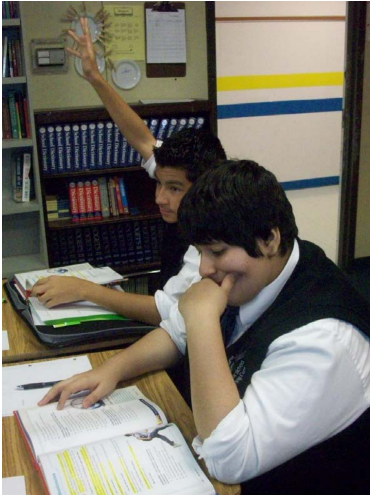
Pictured above: Middle school students at St. Augustine Catholic School follow along in their new textbooks during the first week of school. The textbooks were purchased through a grant from The Catholic Foundation.