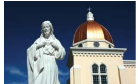
Left to right: The Pines Catholic Camp; St. Augustine School; Sacred Heart of Jesus Chinese Parish