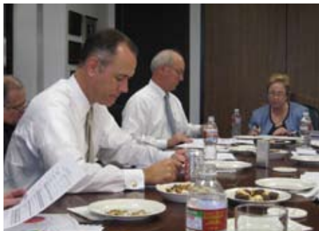
Trustees serve on board committees, approve budgets and review financial statements.