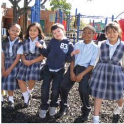
Students at Our Lady of Perpetual Help School, which received a construction grant.

Through significant partnerships, The Catholic Foundation increased educational opportunities for hundreds of Catholic school children, granting additional scholarship funding to the Children’s Educational Fund; supporting outreach programming at the Museum of Nature & Science and the Dallas Children’s Theater; and continuing arts-in-education programming in six Catholic schools with a grant to Big Thought. The trustees also