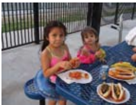
Christian Community Action received a grant for its “Kids Eat Free” lunch program.

The Foundation also granted funding to Immaculate Conception Parish in Grand Prairie to replace computers and update technology, and to the fast-growing Our Lady of Angels Catholic Church in Allen to add an Adult Faith Formation Coordinator to the staff.