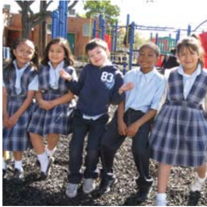
Students at Our Lady of Perpetual Help School, which received a construction grant.

Through significant partnerships, The Catholic Foundation increased educational opportunities for hundreds of Catholic school children, granting additional scholarship funding to the Children’s Educational Fund; supporting outreach programming at the Museum of Nature & Science and the Dallas Children’s Theater; and continuing arts-in-education programming in six Catholic schools with a grant to Big Thought. The trustees also