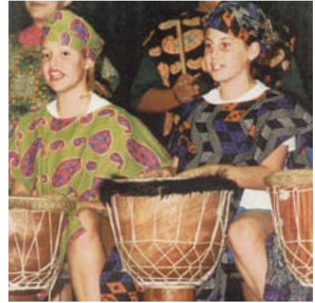
Grant recipient Big Thought will provide arts-in-education programming for six Catholic schools.

Through significant partnerships, The Catholic Foundation increased educational opportunities for hundreds of Catholic school children, granting additional scholarship funding to the Children’s Educational Fund; supporting outreach programming at the Museum of Nature & Science and the Dallas Children’s Theater; and continuing arts-in-education programming in six Catholic schools with a grant to Big Thought. The trustees also