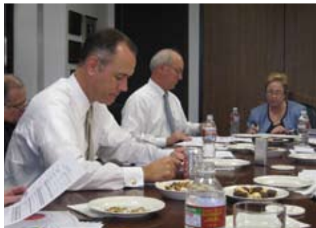
Trustees serve on board committees, approve budgets and review financial statements.