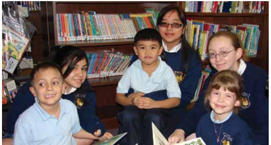
Children's Education Fund

Several grants will help local organizations pursue their mission of serving the poor and elderly. A grant to Catholic Charities will help provide emergency aid to veterans and the elderly poor. Christian Community Action in partnership with the youth ministry of St. Ann Catholic Church in Coppell will use its grant for the “Kids Eat Free” lunch program in the summer of 2012.