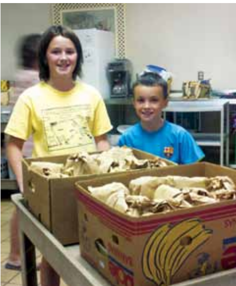
Kids Eat Free — Christian Community Action, St. Ann Catholic Church, Coppell

Meeting twice a year, the Distribution Committee of the Board of Trustees reviews grant applications and recommends that grants be awarded to those agencies and organizations that have pressing needs or projects that serve the physical and spiritual needs of the Catholic community.