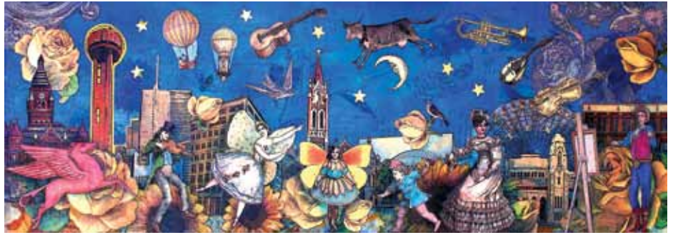
"Dallas in Wonderland," a collage by Rebecca Guy, is now on display in The Catholic Foundation Plaza in the Dallas Arts District on the grounds of the historic Cathedral Shrine of the Virgin of Guadalupe, at the corner of Crockett and Flora streets. Winning artists are selected by a panel of respected members of the local arts community. The Plaza was funded by a gift from The Catholic Foundation in celebration of its 50th anniversary six years ago. To view the winning artwork as well as all entries submitted, please visit the Foundation's website at www.catholicfoundation.com .