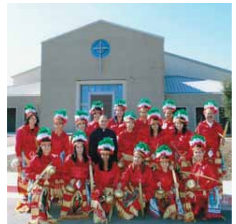
St. Cecilia Catholic Church