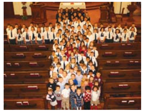
St. Mary's Catholic School, Sherman, Texas

Support for the dental program was awarded to the Grand Prairie Wellness Center at Immaculate Conception Parish, and the St. Joseph's Residence received funding for the construction of a 20-room addition – fulfilling the philanthropic intentions of four different donors whose legacies include their provisions for ongoing financial support for the community's poor and needy and its senior citizens.