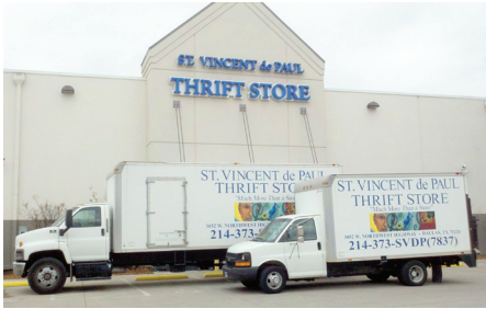
St. Vincent de Paul Thrift Store continues its pick-up service in the DFW area and will open a new store in North Dallas this year.

T wenty-five Dallas-area schools, churches and organizations will be able to renovate or construct facilities, enhance technology, replace equipment, assist students with tuition, and support programs, thanks to $792,990 in grants recently made by The Catholic Foundation during its Fall Distribution cycle.