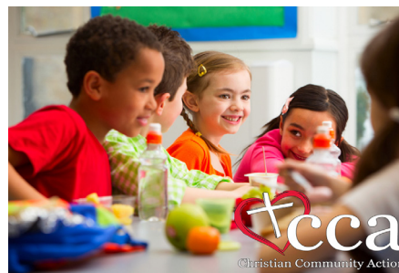
The Kids Eat Free program feeds more than 1,500 disadvantaged children during 11 weeks of summer.

Two schools, Good Shepherd Catholic School and St. Patrick Catholic School, will expand technology, while St. Vincent de Paul