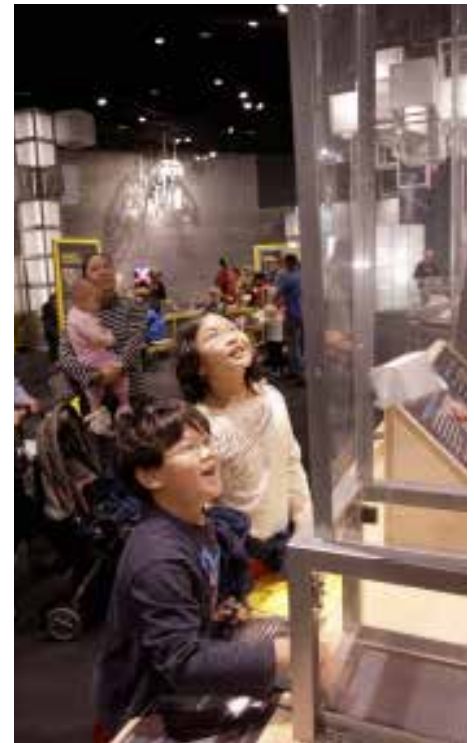
A generous grant from the Louise Buhrer Endowment Fund enables children in Dallas Diocesan schools access to educational field trips to the Perot Museum of Nature and Science.

The Catholic Foundation continues its support through funding desks and chairs at Holy Trinity Catholic School , a bus for Cistercian Preparatory School , funding for Zero to Five Funders’ Collaborative , and accreditation funding for Birth Choice Dallas .