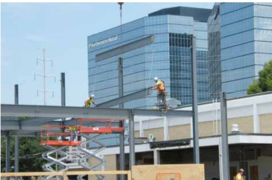
New campus lighting is an important part of the St. Rita Catholic Community’s new building that will be completed in February 2016.