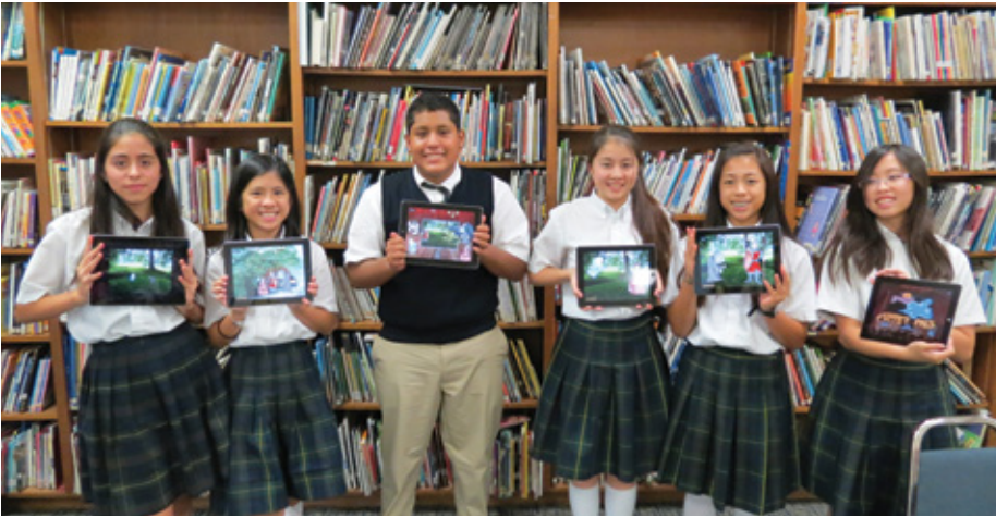
Holy Family of Nazareth School received grant assistance for technology and tuition assistance.

With assistance from $687,559 in grants announced by The Catholic Foundation this spring, 21 Dallas-area schools, churches and organizations will be able to expand programs, enhance technology, renovate or construct facilities, replace equipment, and assist students with tuition.