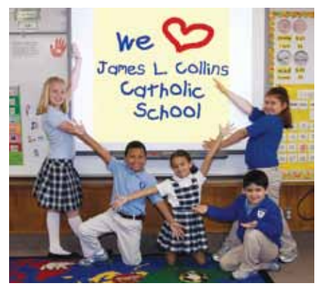
Students at James L. Collins Catholic School in Corsicana, Texas.

The Distribution Committee of the Board of Trustees meets twice a year to review applications and recommend grants to be awarded to agencies and organizations that can best serve the physical and spiritual needs of the Catholic community.