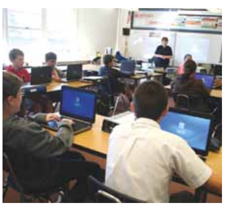
Students at St. Monica Catholic School learning updated technology skills.

At Mount St. Michael Catholic School, an award will update technology and provide a computer on wheels and laptops for teachers, while a grant to St. Thomas Aquinas Catholic Church and School will update the wireless infrastructure and fiber optic backbone. An award to St. Elizabeth of Hungary