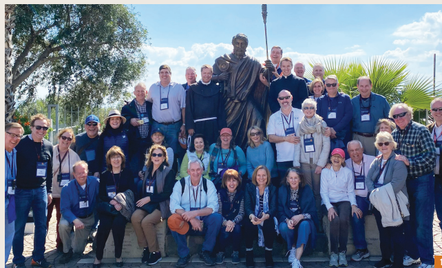
1 Holy Land pilgrims in front of the statue of St. Peter in Capernaum