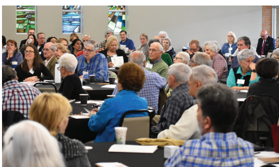
An overflow room of guests enjoyed the End Of Life seminar at St. Rita Catholic Community.