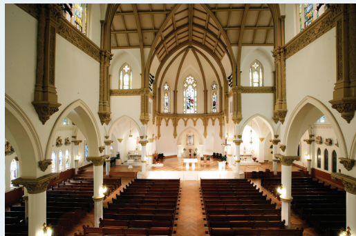
The Cathedral Santuario de la Virgen de Guadalupe in downtown Dallas