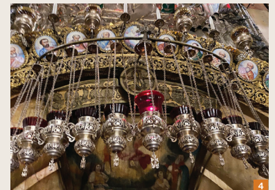
4 The Church of The Holy Sepulchre