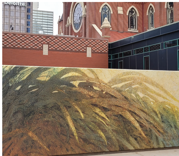
The 2020 Art On The Plaza winning image, Continuo , created by Robyn Jorde.

The submission deadline is September 9, and a panel of members from the local arts community will review all entries. The winning piece will be dedicated on the Plaza art wall on October 20. 🐟