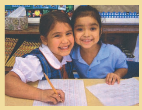
Immaculate Conception School