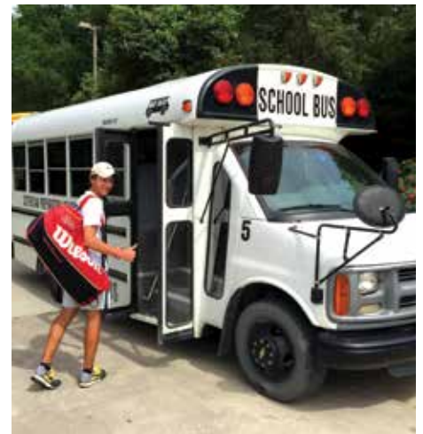
Cistercian received a grant for the purchase of a new 14 passenger bus