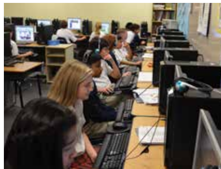
St. Elizabeth of Hungary students will benefit from an updated technology lab.

Classroom, office and facilities technology was a focus of several of the awards. Holy Family Nazareth Church will update office technology, Mary Immaculate Catholic School will update its computer lab, and St. Mark Catholic School will update technology. Mount St. Michael Catholic School will upgrade security and communications systems and also provide tuition assistance, with funding provided by the Dorothy Irving Memorial Fund.